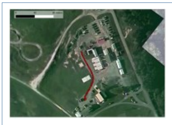
Figure 2. The georeferenced trajectory of the tracked vehicle computed from an airborne video clip.

track objects for extended periods of time without reinitialization. Coupling the tracking technology with the georeferencing tools we can map the trajectories in a georeferenced coordinate system. All this reducing the manual intervention required to the image analyst