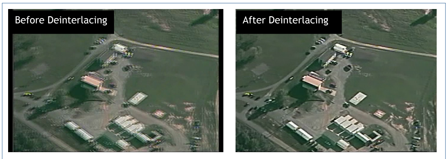
Figure 1. The results of the innovative deinterlacing technology by Mayachitra. The content of the original image is entirely preserved. The AP Hill data was provided by the DARPA VIRAT program.

Our tools allow to restore the frames quality (see Figure 1), and to reliably